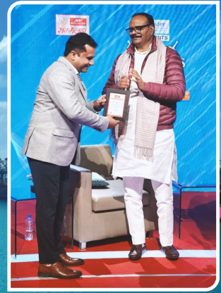
Awarded By Sh. Brijesh Pathak (Hon'ble Deputy Chief Minister Uttar Pradesh)