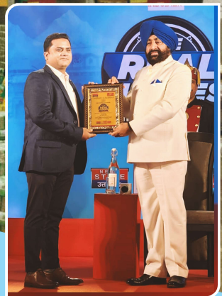
Awarded By Sh. Gurmeet Singh Lt. Gen. (Retd.) (Governor of Uttarakhand, BJP)